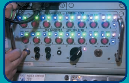
C Control unit