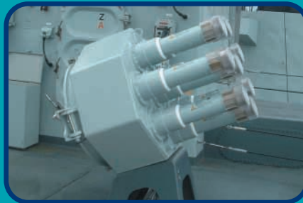
E Expendable launcher