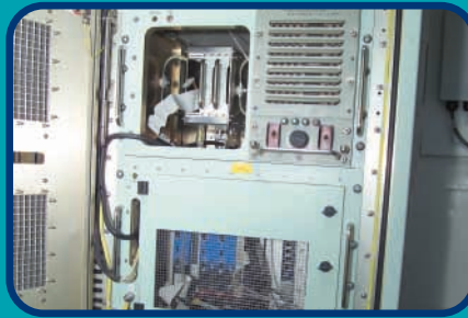
B Equipment cabinet