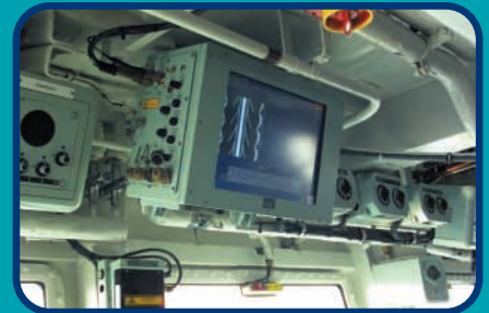
F Bridge display