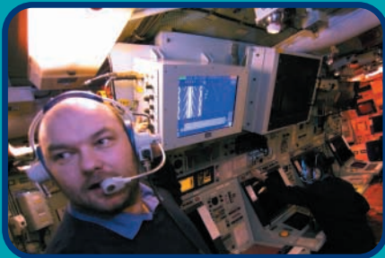
D Operator display